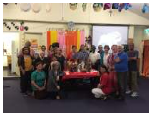
Our Christmas gathering